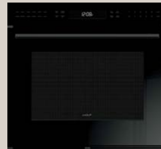
DUAL 30" WOLF CONVECTION OVENS Convection Oven with porcelain blue interior.

Take advantage of the most innovative steam oven on the market today. Virtually any dish prepared in a microwave, conventional oven, or range can also be prepared in the Wolf convection steam oven - with more control.