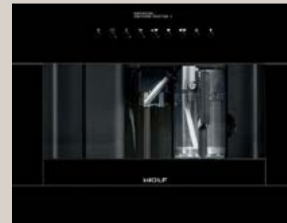
30" WOLF COFFEE SYSTEM

Create perfectly brewed coffee, espresso, cappuccino, macchiato and latte at home.