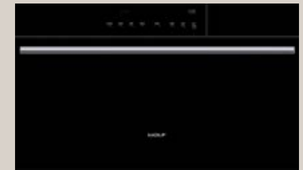
30" WOLF CONVECTION STEAM OVEN

Create perfectly brewed coffee, espresso, cappuccino, macchiato and latte at home.