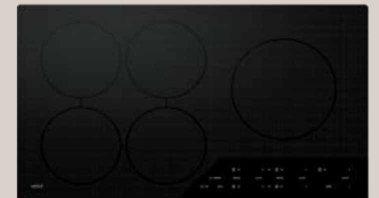
36" WOLF COOK TOP Induction Stove.