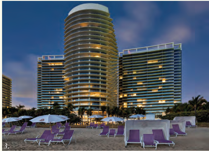
3. Beach Cabanas