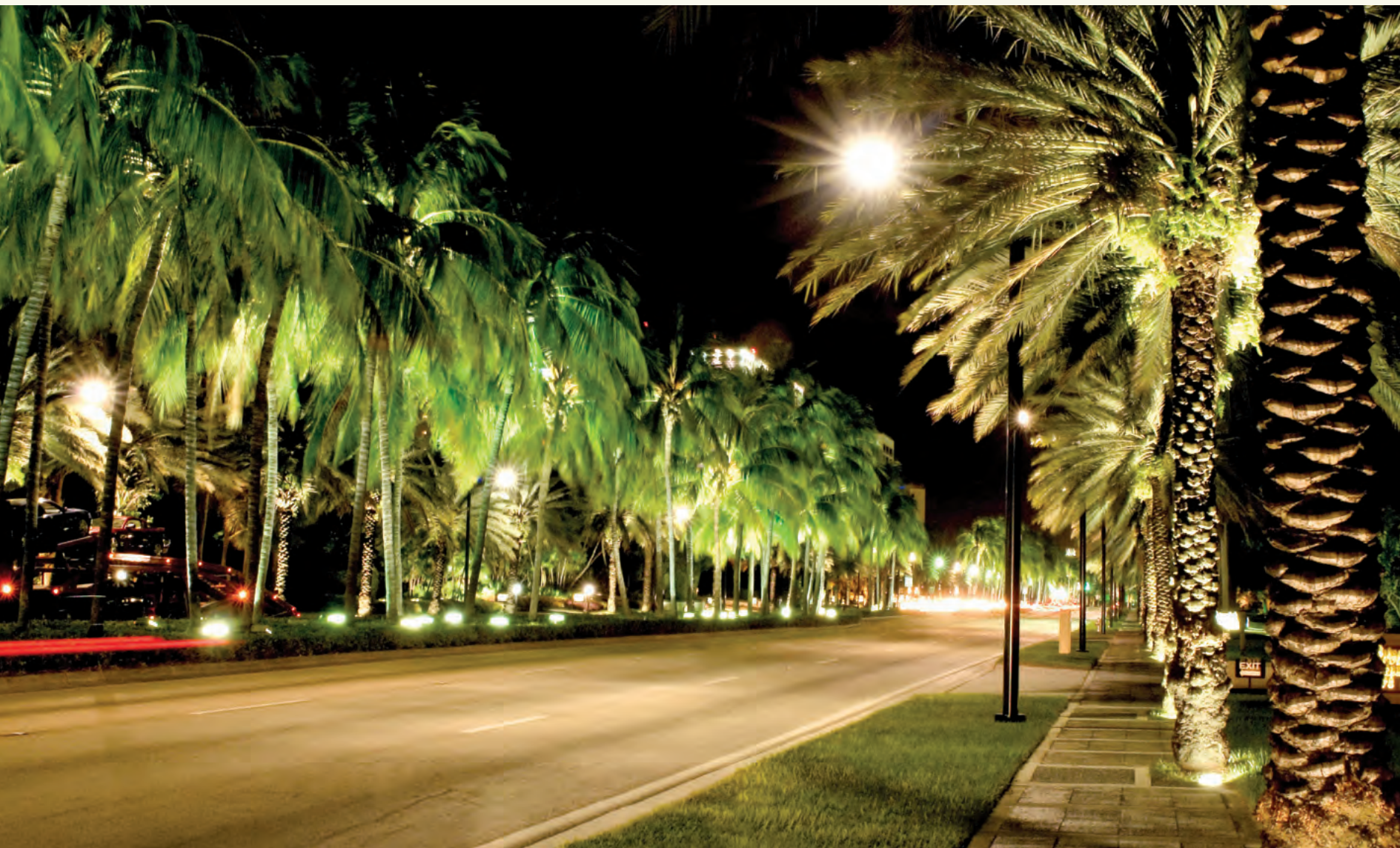
Collins Avenue in Bal Harbour