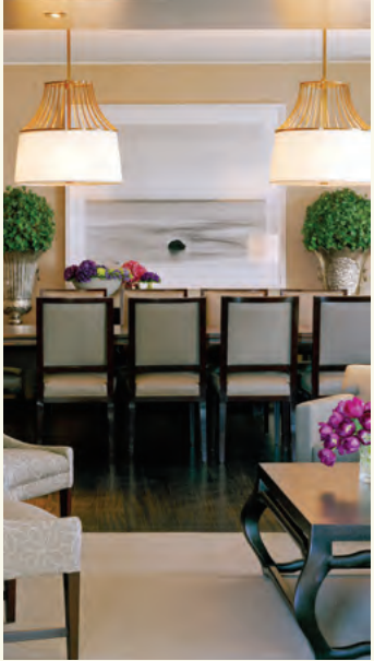
The St. Regis San Francisco San Francisco, California

THE HOTEL SUITES, LOBBIES AND COMMON AREAS OF THE ST. REGIS BAL HARBOUR Resort are being designed by Yabu Pushelberg. With studios in New York and Toronto, Yabu Pushelberg has been honored with the Platinum Circle Award for their exceptional achievement in the hospitality industry, as well as the James Beard Foundation Award for excellence in restaurant design. Since 1980, the Yabu Pushelberg portfolio has included projects of varying scale, including collaborations with some of the world’s leading entrepreneurs, hotel groups, retailers and innovators.