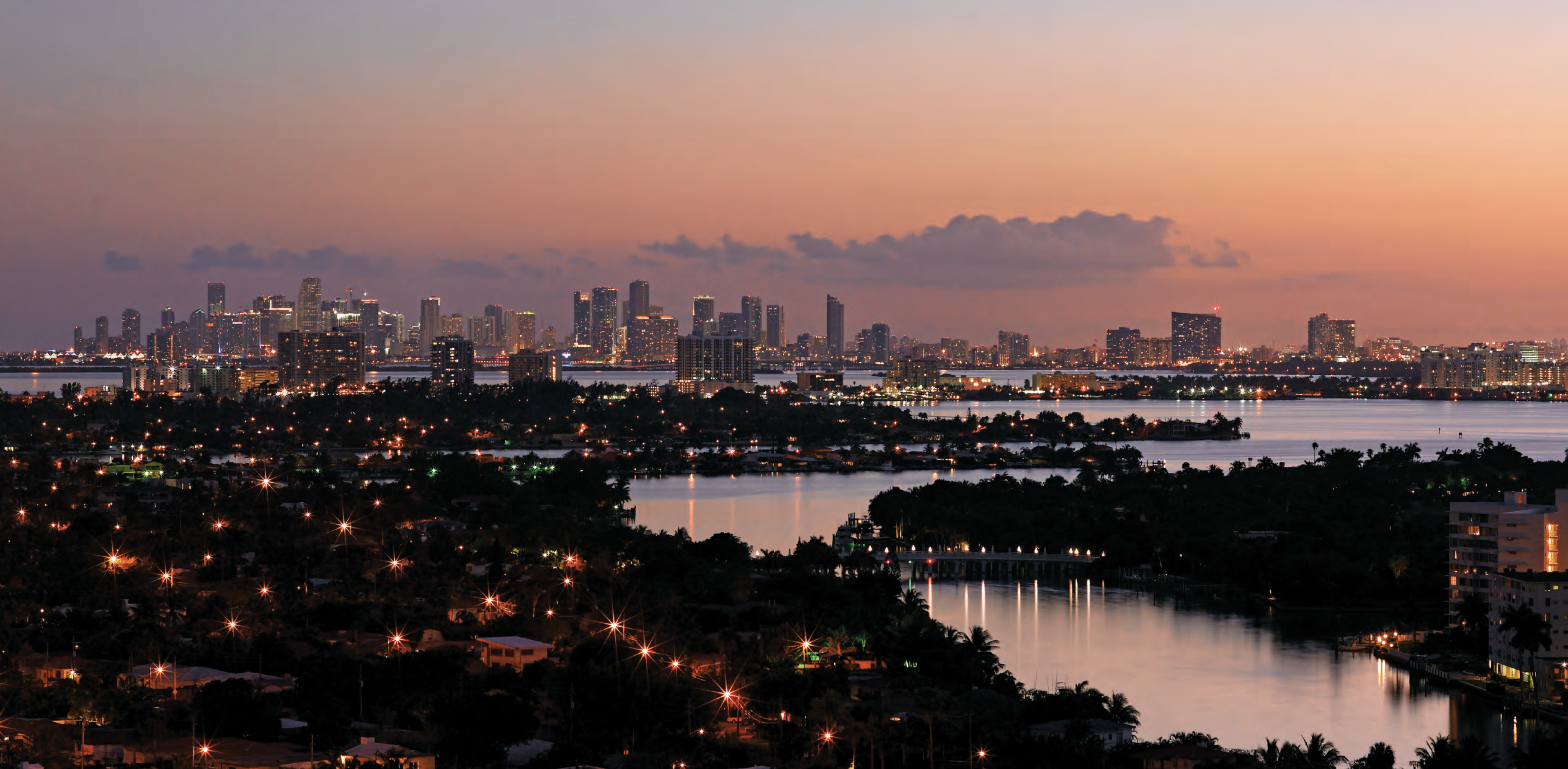
View of Downtown Miami from The St. Regis Bal Harbour Resort.