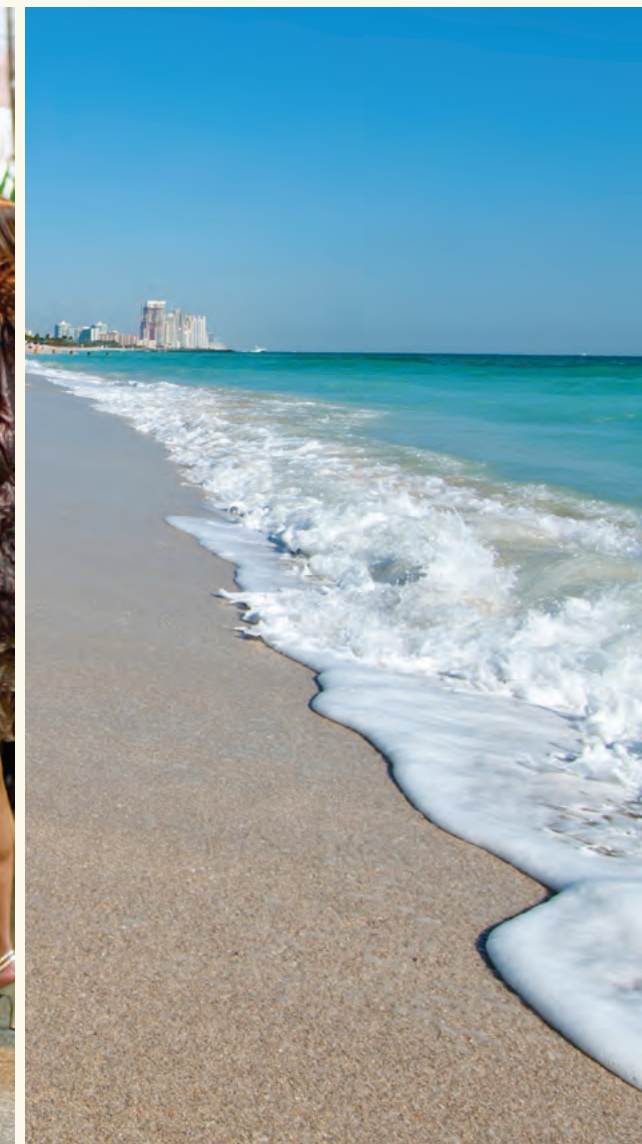
Atlantic Ocean sand beaches