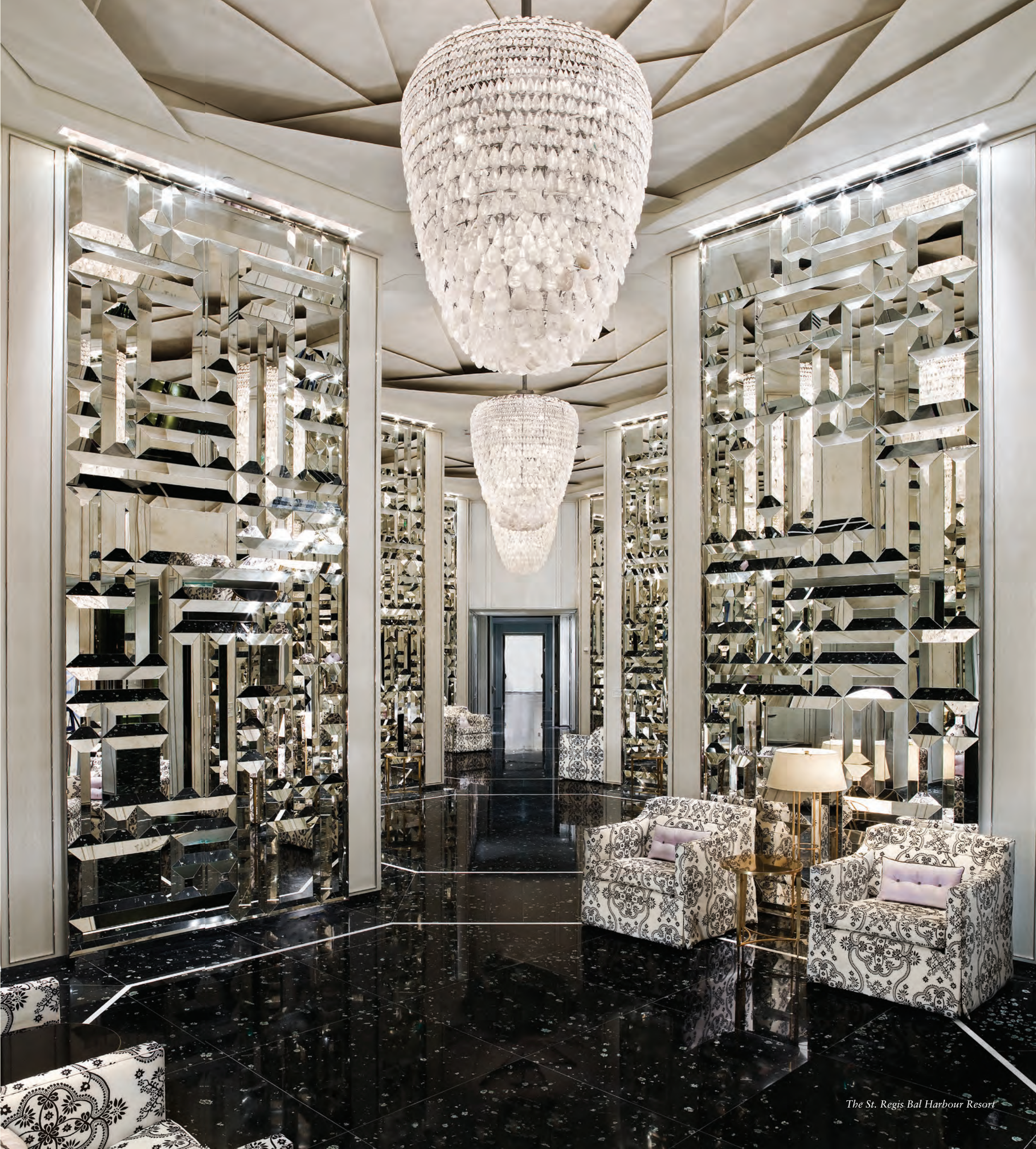
The St. Regis Bal Harbour Resort