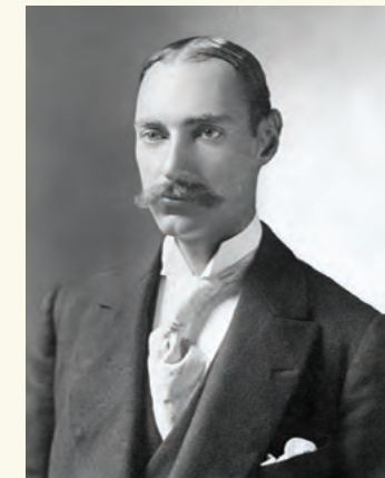
John Jacob Astor IV