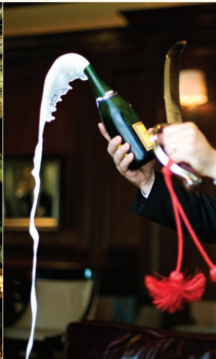
St. Regis tradition of Champagne Sabrage