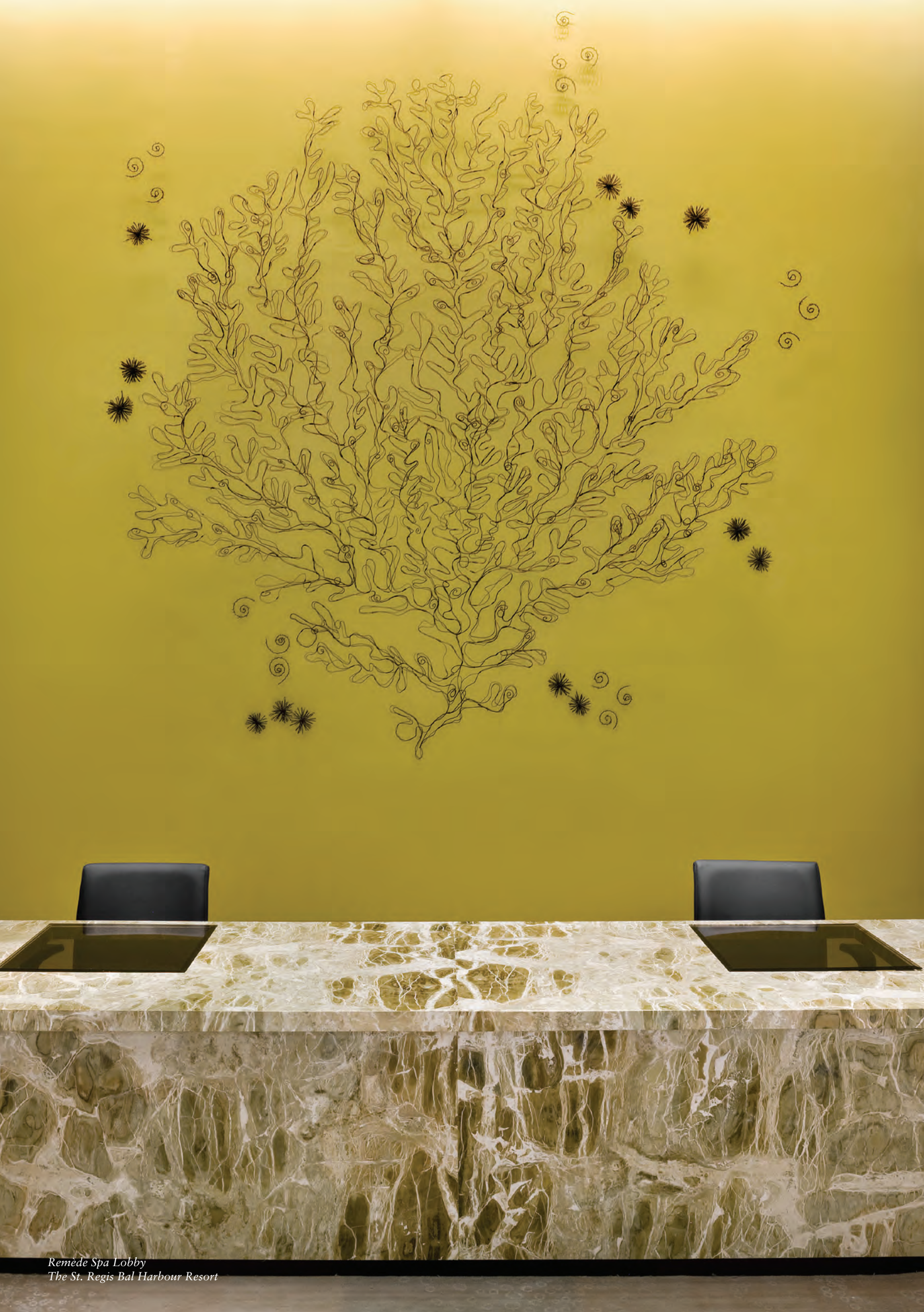
Remède Spa Lobby The St. Regis Bal Harbour Resort