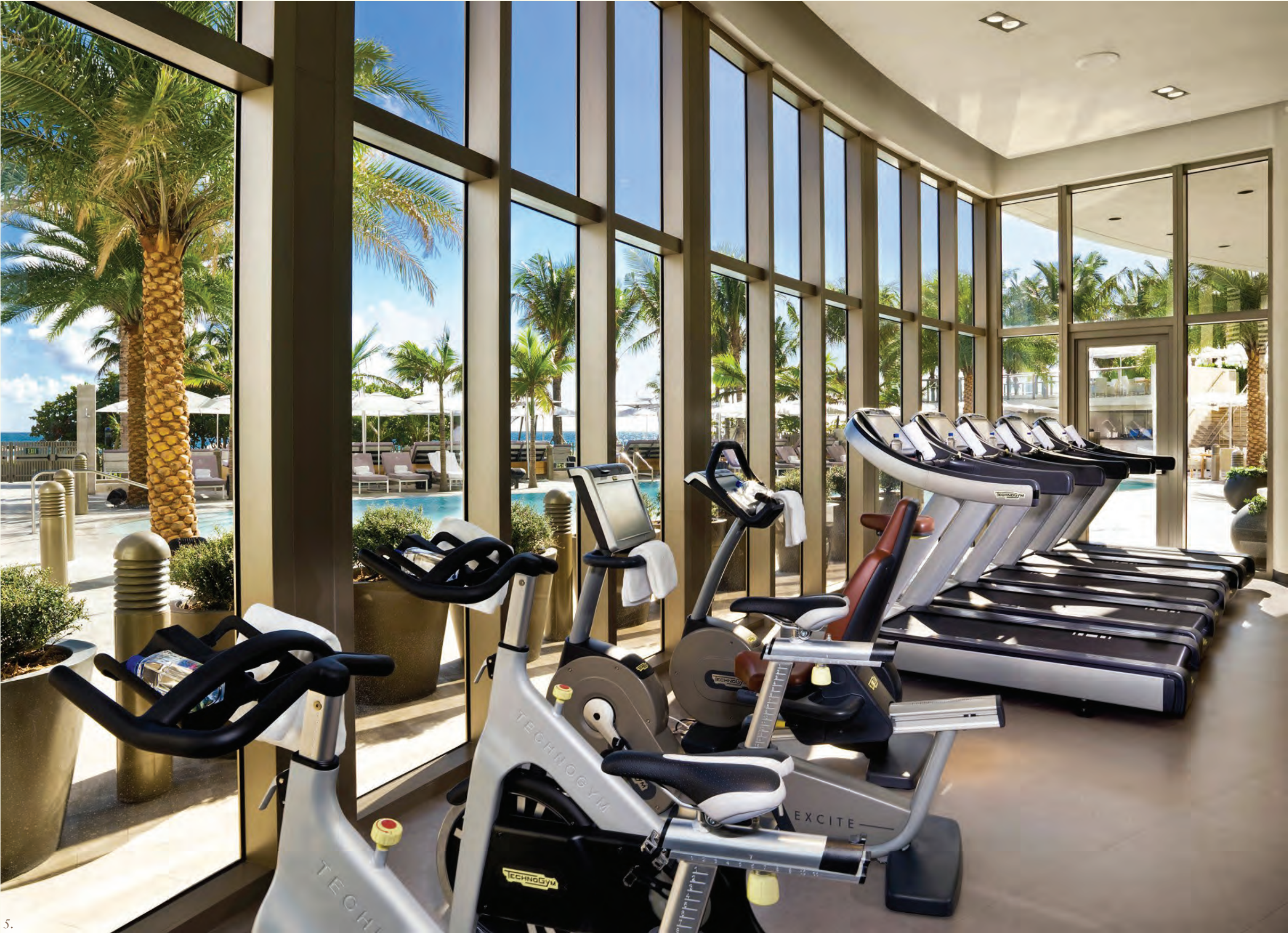
5. Center Tower Athletic Club