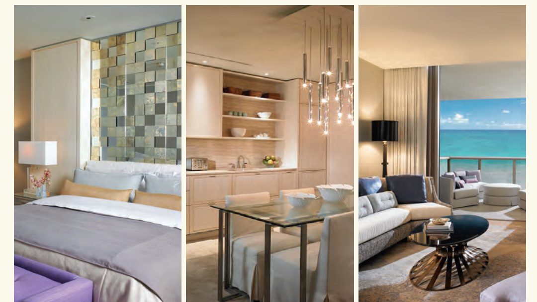
Furnishings may vary.

Two- to five-bedroom Residences as well as condominium hotel suites are offered, with multiple floor plans and extraordinary views of beach, ocean and the city beyond. Many Residences have fireplaces, and feature private entry foyers off elevators and outdoor balcony “living rooms” ranging in size up to 1,400 square feet. Designer-ready interiors offer the opportunity to customize the space with the buyer’s own personal style.