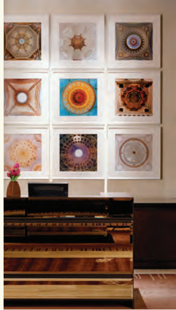
The St. Regis San Francisco San Francisco, California