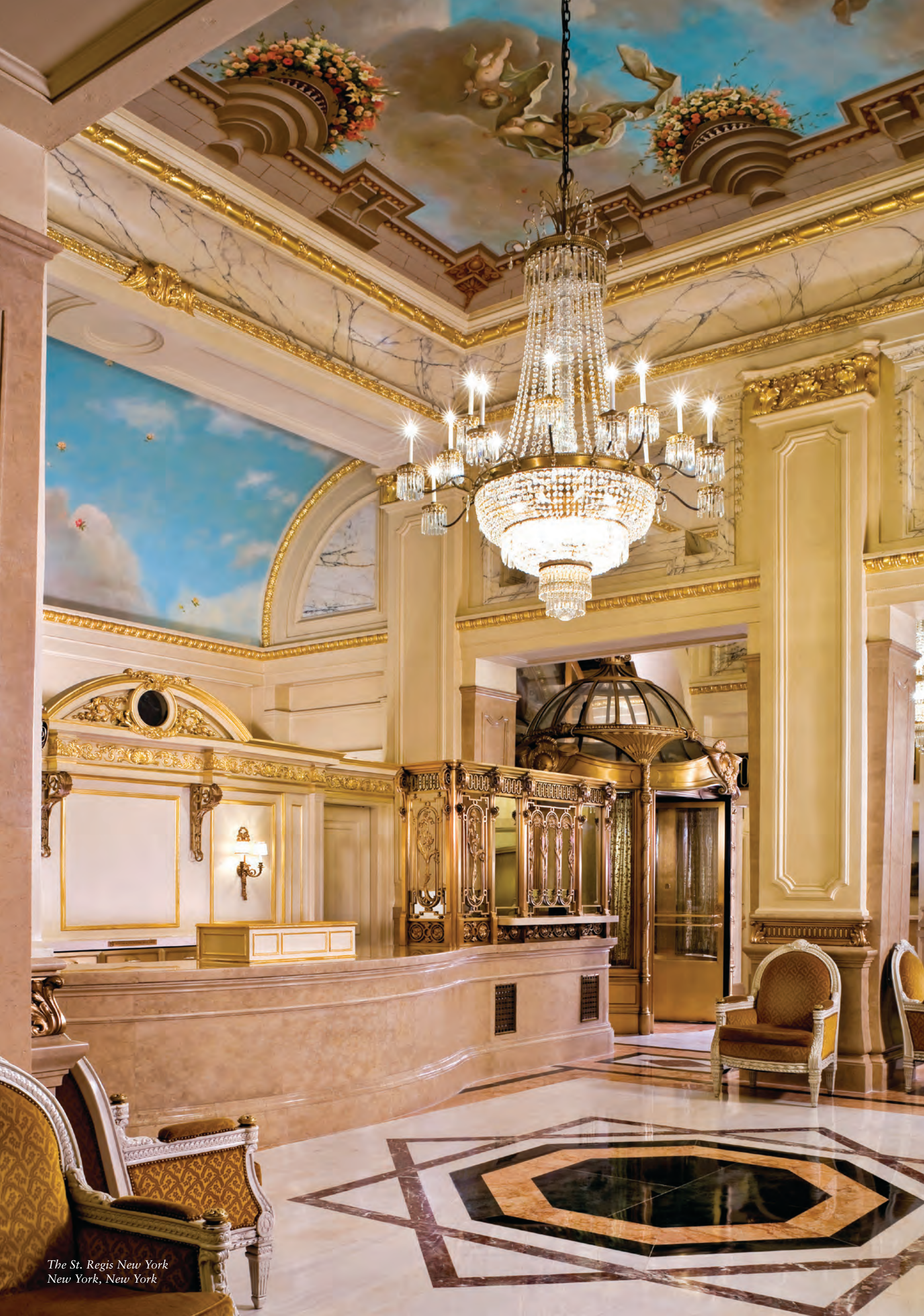
The St. Regis New York New York, New York