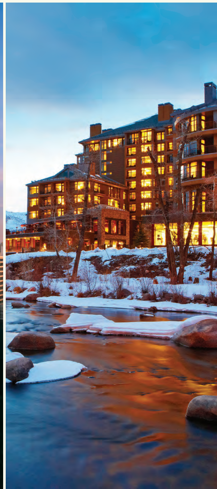
Sheraton Mallorca Arabella Golf Hotel Palma de Mallorca, Spain