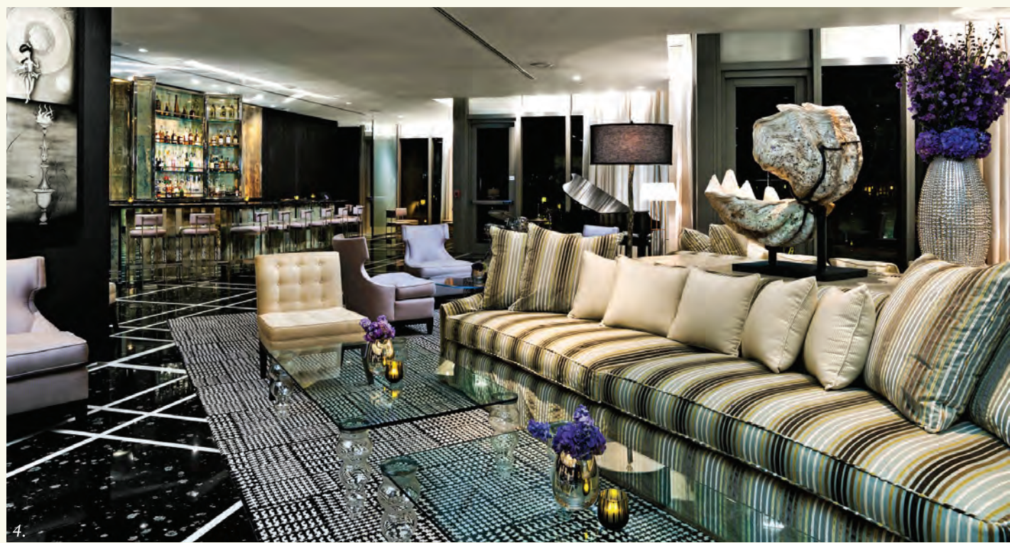
4. The St. Regis Bar