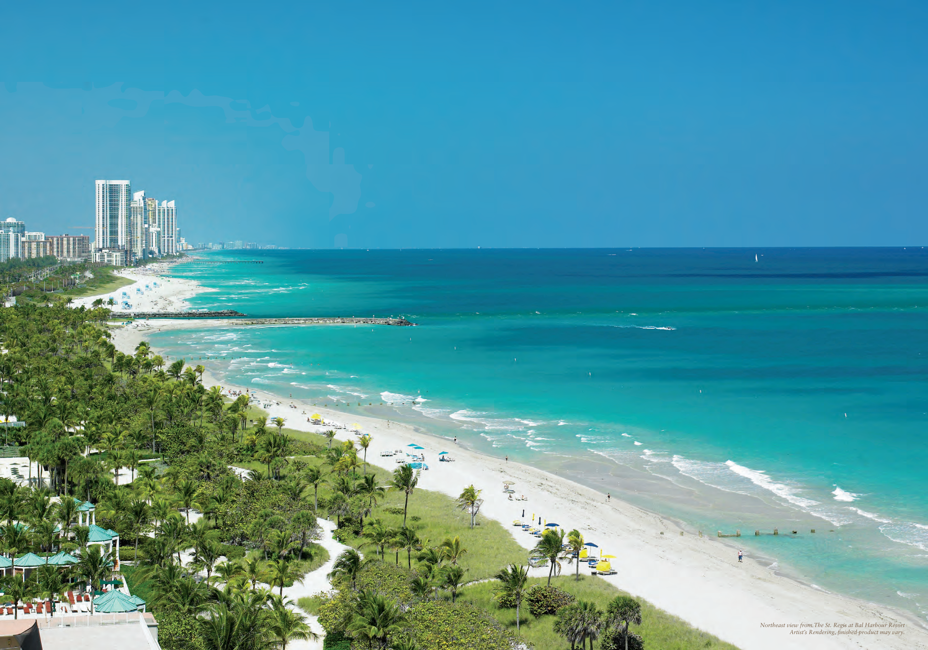
Northeast view from The St. Regis at Bal Harbour Resort Artist's Rendering, finished product may vary.