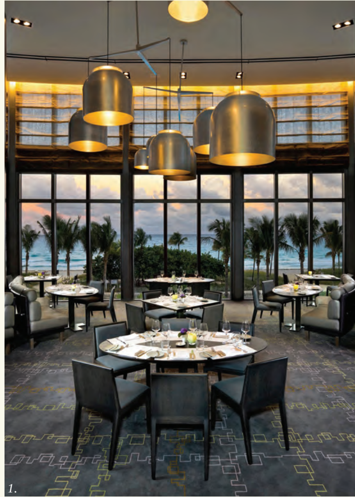
1. J&G Grill®