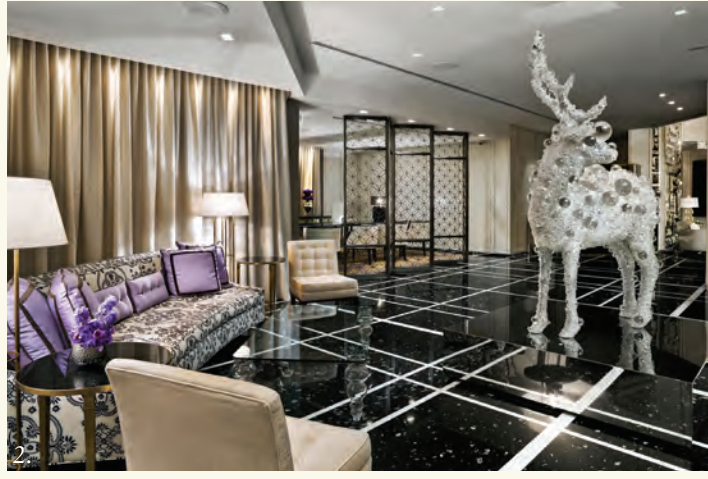
2. Hotel Reception Area