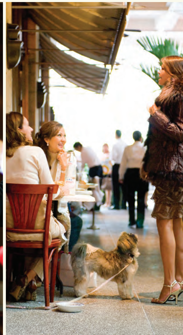
Carpaccio Restaurant at Bal Harbour Shops