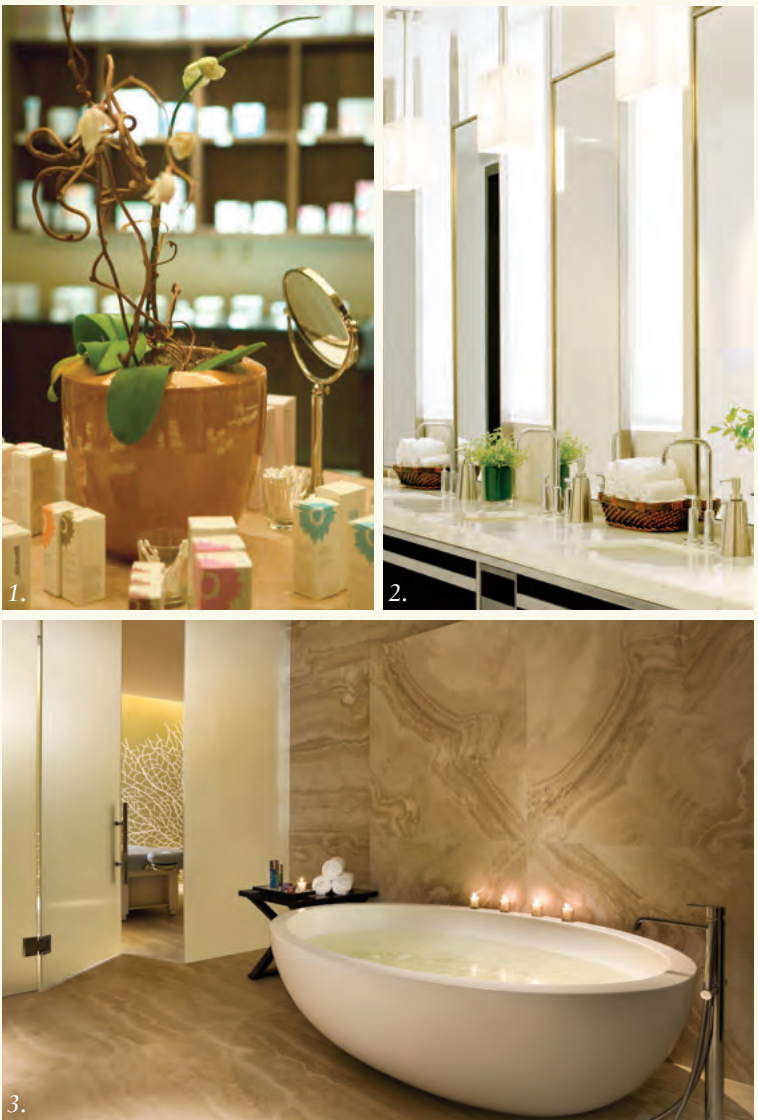
1. St. Regis Aspen Residence Club Aspen, Colorado 2. The St. Regis Mexico City Mexico City, Mexico 3. The St. Regis Bal Harbour Resort Bal Harbour, Florida

ALLOW YOUR MIND AND BODY TO ESCAPE TO AN OASIS OF calm and serenity at the 12,000-square-foot Remède Spa, which is conveniently located within The St. Regis Bal Harbour Resort. Inspired by the exclusive skincare line Laboratoire Remède, Remède Spa combines a comprehensive menu of facial, massage, body, wax and nail services with signature touches like champagne and Jacques Torres truffles to help you relax and unwind.