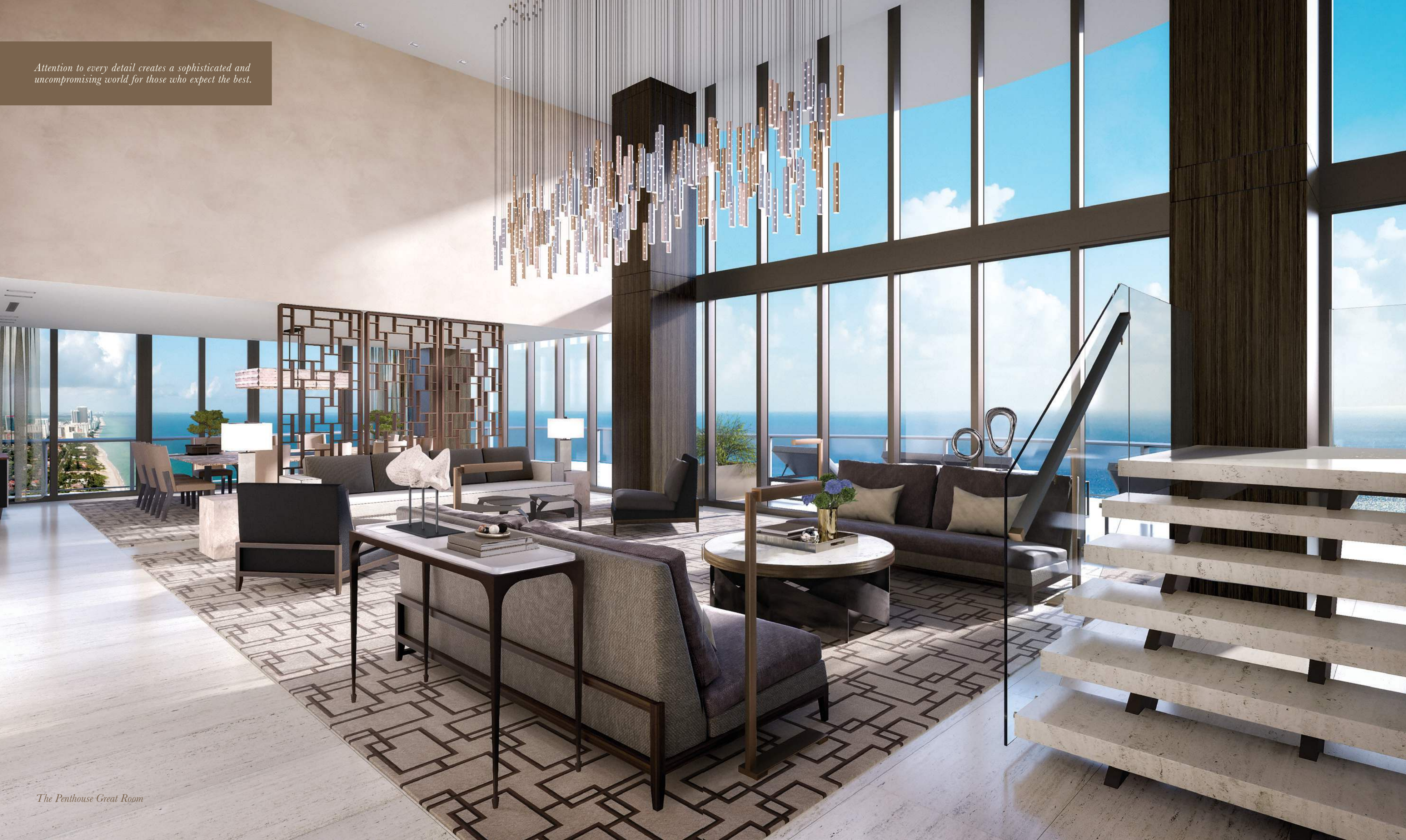
The Penthouse Great Room

Attention to every detail creates a sophisticated and uncompromising world for those who expect the best.