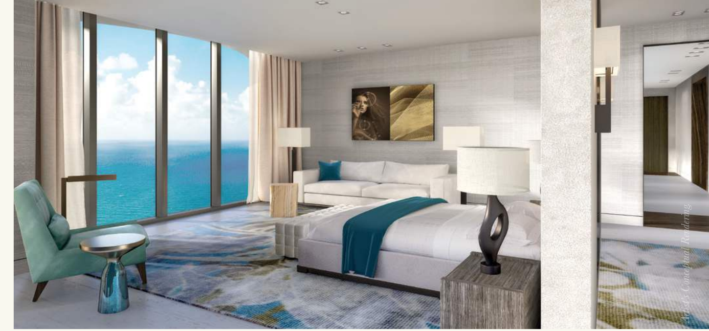
The Penthouse Master Bedroom