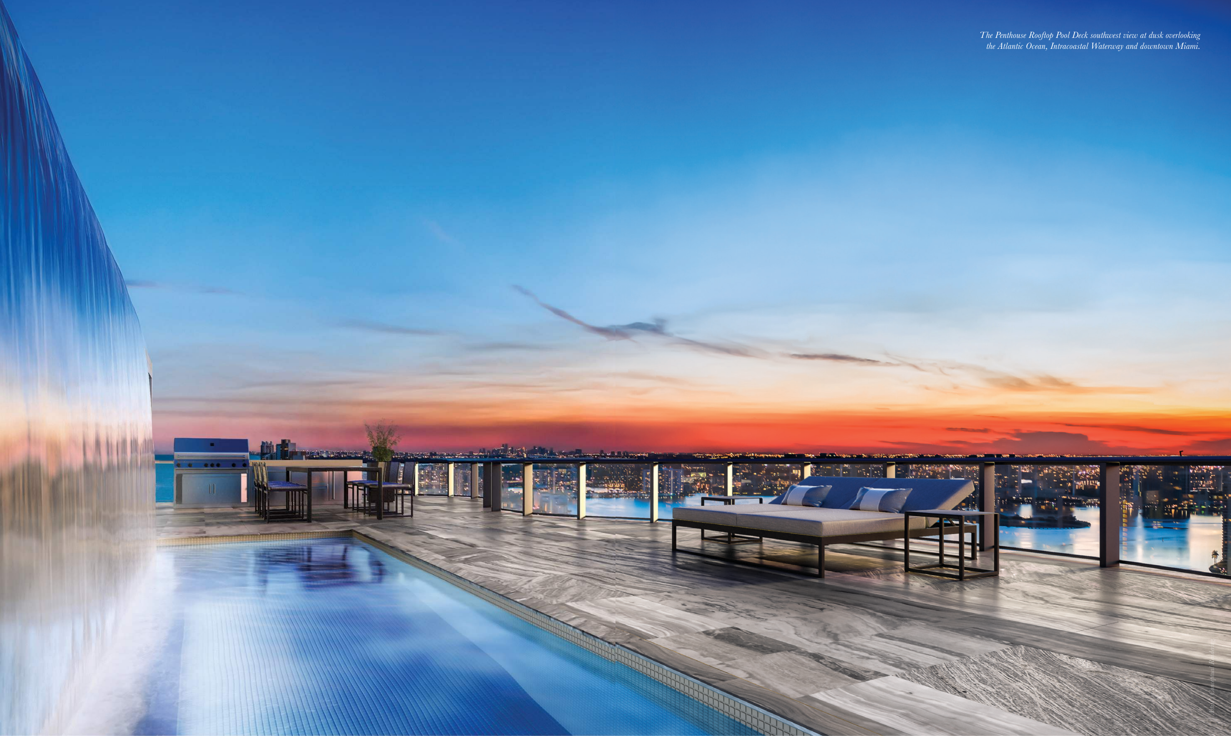
The Penthouse Rooftop Pool Deck southwest view at dusk overlooking the Atlantic Ocean, Intracoastal Waterway and downtown Miami.