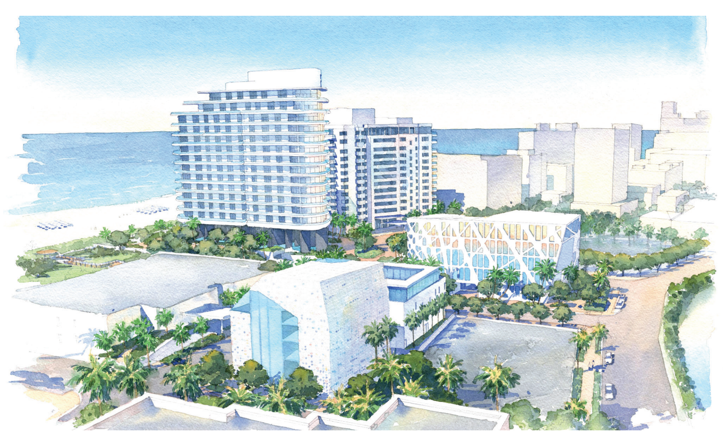
Looking south towards Faena District. Artist Rendering.